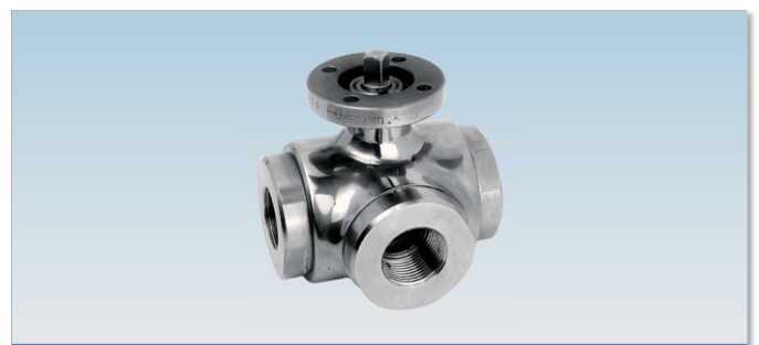
TRISTAR PER ATTUATORE